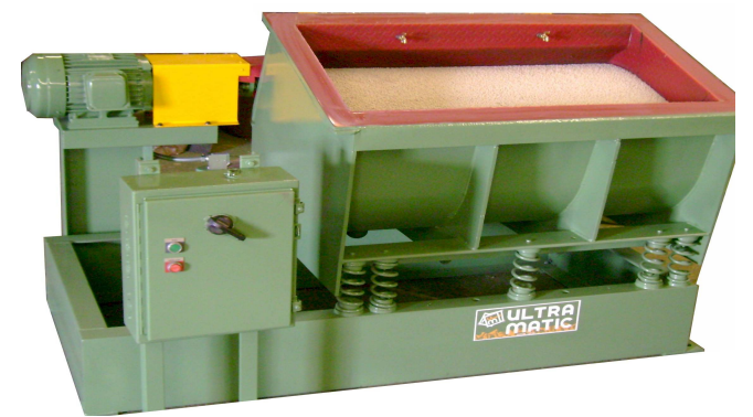
MODEL OHD 3048 SHOWN RUNNING POLISHING BALLS

The Ultramatic OHD series are batch tub machines ranging in size from 3 to 400 cubic feet processing capacity. Our Patented Overhead Drive System provides unparalleled vibratory energy. The result is any size part made can be processed in our OHD machines. (See OHD9696 article)