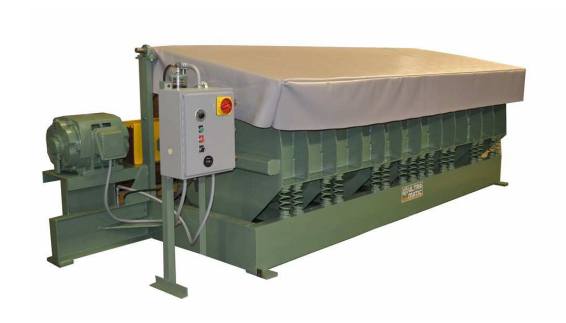
MODEL OHD 36144 With Sound Cover